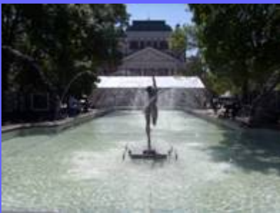
Illustration from the Institutional Cooperation policy from Artois-Picardie River Basin (France)