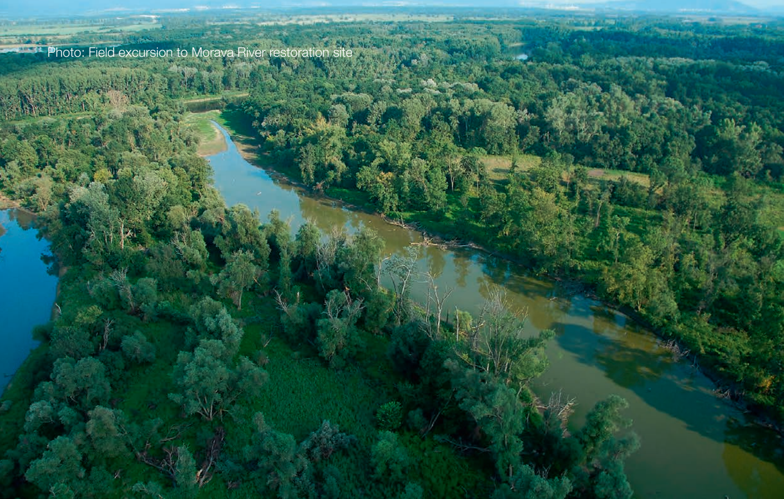
Photo: Field excursion to Morava River restoration site