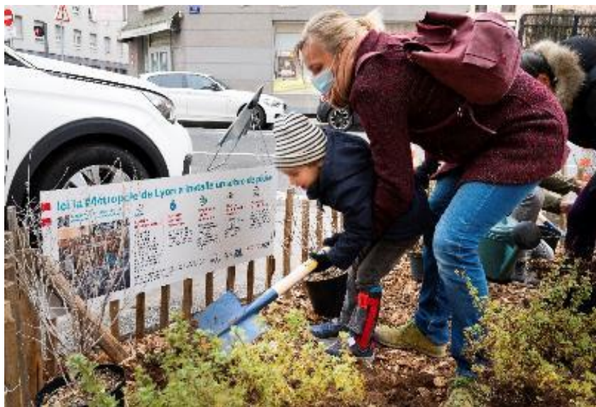
Planting « rain trees » in the city of Lyon (November 2021)