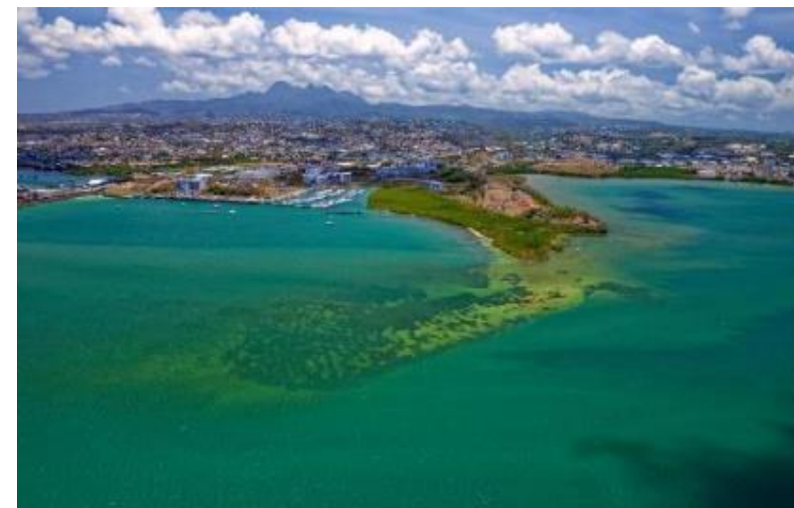
Mangroves protecting the Z'Abriots port from typhoons (Martinique)