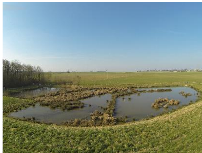
Wetland restoration to prevent flooding and improve natural epuration in the Brie valley